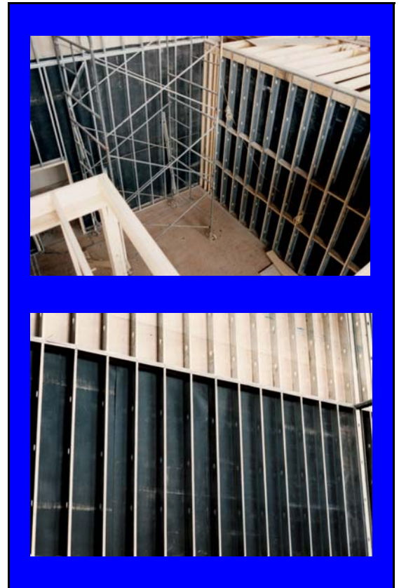
Typical Wall Construction